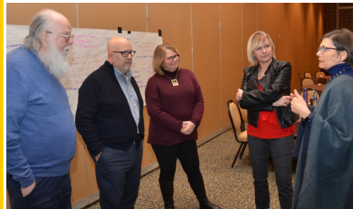
Symposium 2018 Highlights